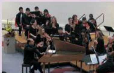
Mission College Symphony July 17