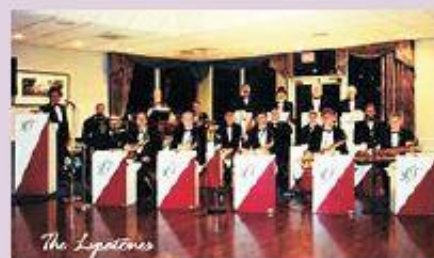
The Lyratones August 21