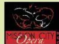
Mission City Opera June 29