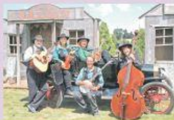
Sidesaddle & Co. July 24