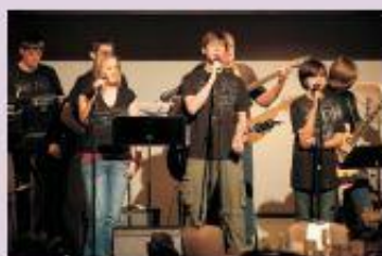
The 357's August 14