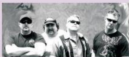
Cool Under Pressure August 7